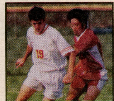
see Men's Soccer page 9