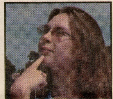
see Roaming Reporter page 6